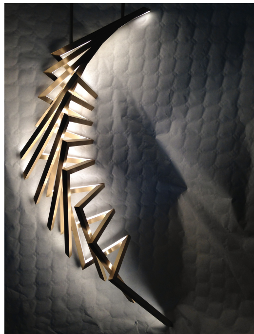
« Dorsale » light fitting.

Jennifer, Cyril and Malo are specialized in working with brass. Craftspersons, they are also artists. Their works are as much the result of a gesture as of a thought, technical and esthetic at the same time. Partly craftsmanship partly abstract art, the lights or pieces of furniture created by Mydriaz are both functional and poetic – their creations are much more than useful, they resemble more sculptures of metal and light. Brass is a copper and zinc alloy, with a semi-precious appearance. It is a medium which offers a large number of possibilities for creation, it indeed permits an infinity of finishes and great delicacy in the end product. Mydriaz heats it, bends it, cuts it, shapes it to create works which are sometimes softly shaped and sometimes clear-cut.