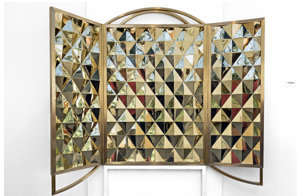
« Retable » mirror.