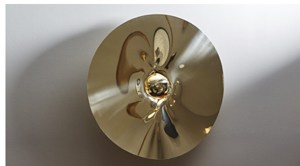
« Mercure » wall lamp.